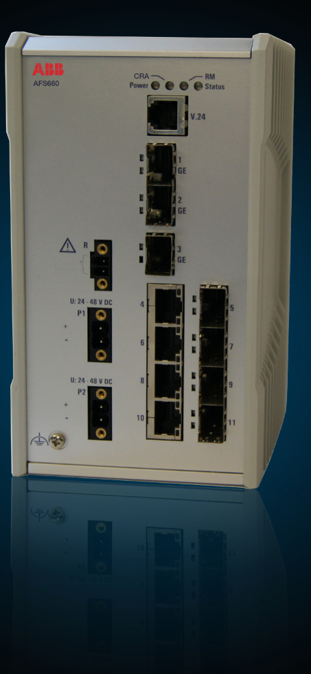
ABB AFS660 Switch High-availability Ethernet device based on new IEC-standard redundancy protocols PRP/HSR